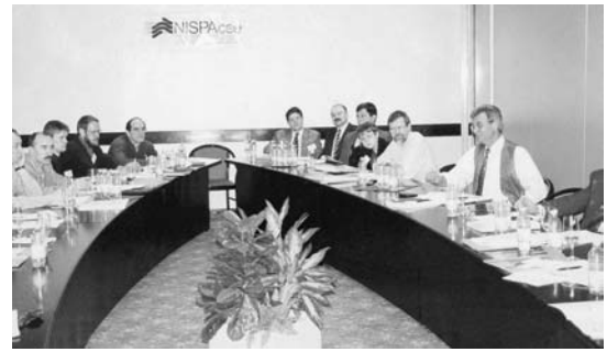
Working Session II.

action should be focused on rationalisation of all public activities through increased efficiency and effectiveness of public administration organisations, however without detracting from quality of services, right of choice or user-friendliness of the administration. Presentations of papers highlighted different possible approaches to reducing the administrative burdens through decentralisation and better organisation of local services, better human resource management, improved training and innovative use of information and communication technology.