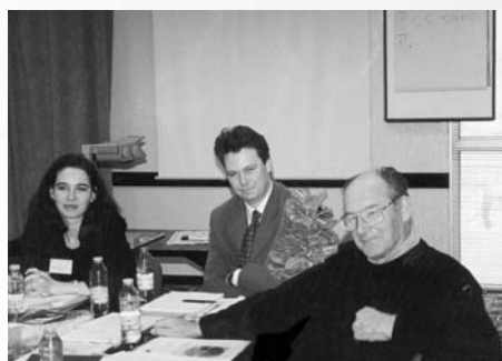
Working Group 1:

sion during the working group meeting in Sofia focused on the analysis of factors determining the nature of politico-administrative relations, the development