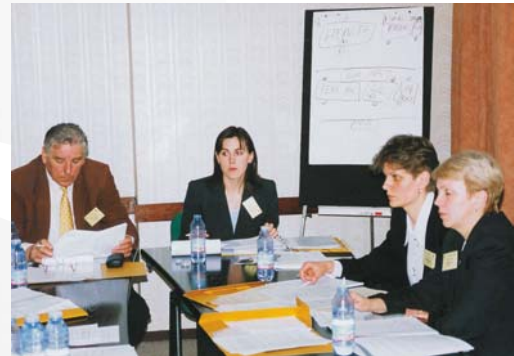
Working Group 2:

group to further evaluate the discussed subjects and to apply for funding for future research.