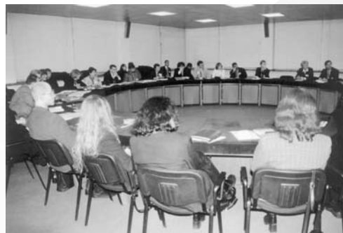
2 nd Steering Committee Meeting, Bucharest, January 1999

accessible for translation/ adaptation at national level.